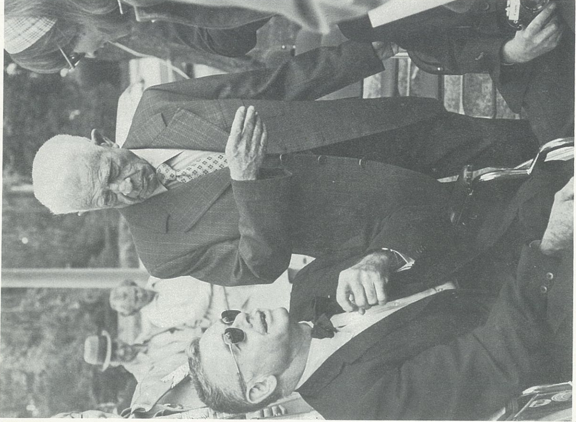
RODE AND RED PROBST