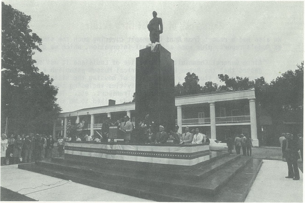
THE DEDICATION CEREMONY