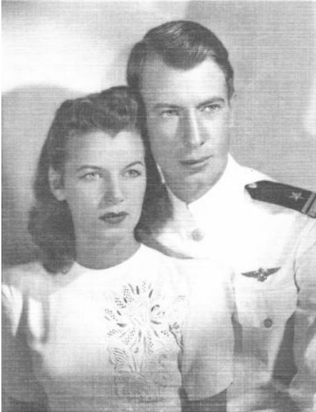
1918 - 2010 "Flights of angels sing thee to thy rest" William Shakespeare