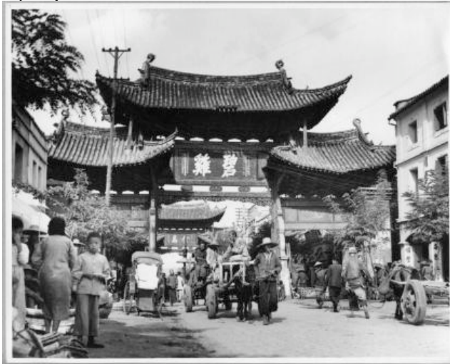
Kunming circa 1943

By the time you read this, it will be less than 2 months until the 2010 CNAC Association reunion, taking place again at the Embassy Suites in Burlingame, CA, September 8-12. We are expecting many of the usual suspects, as well as some people we haven't seen in a while. You'll find all the information you need to register and make your reservations on the last page of this newsletter. Please do come if you possibly can. You know you'll have a great time, and we'll have an even better time, if you are there too!